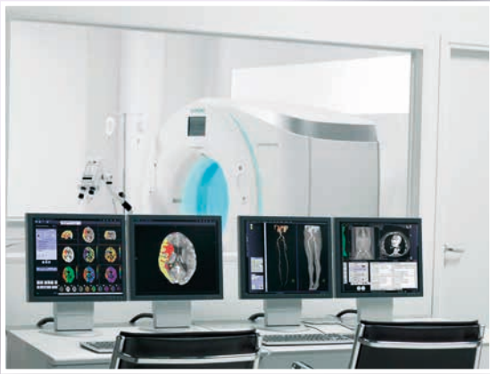
參考圖片 Reference photo