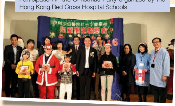
參加香港紅十字會醫院學校舉辦的兒童聖誕聯歡會 Participation in the Christmas Party organized by the Hong Kong Red Cross Hospital Schools