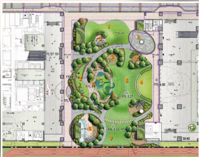
由設計師繪畫的藝術印象圖 Artistic impression prepared by designers