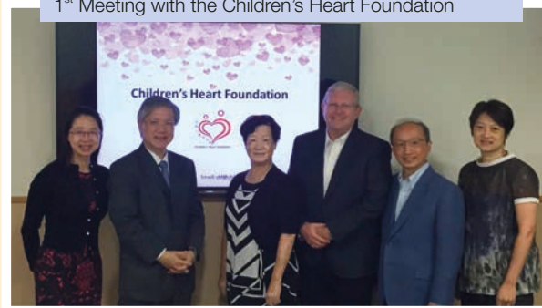
與兒童心臟基金會代表首次會面 1 st Meeting with the Children's Heart Foundation