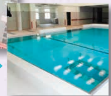
參考圖片 Reference photos