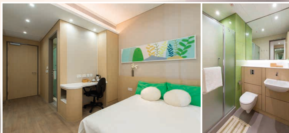
參考圖片 Reference Photos