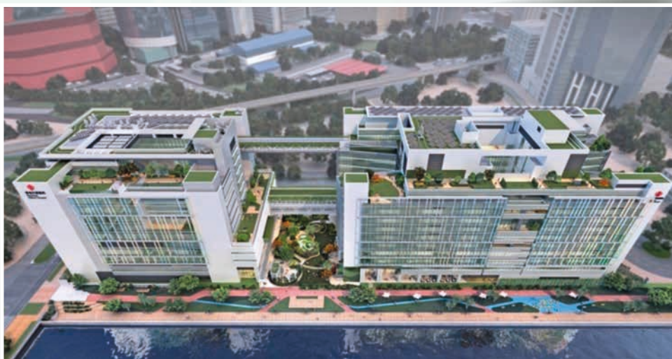
由設計師繪畫的藝術印象圖 Artistic impression prepared by designers

Platinum rating in Provisional Assessment under BEAM Plus NB [V1.2] of the Hong Kong Green Building Council