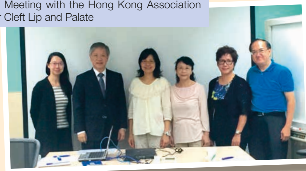
與香港兔唇裂顎協會代表首次會面 1 st Meeting with the Hong Kong Association for Cleft Lip and Palate