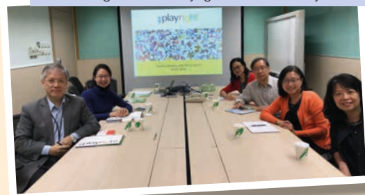
與智樂兒童遊樂協會代表首次會面 1 st Meeting with the Playright Children's Play Association