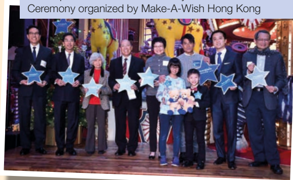
參加香港願望成真基金「分享願望的喜樂 2016」開幕儀式 Participation in "Share the Joy of a Wish 2016" Launch Ceremony organized by Make-A-Wish Hong Kong