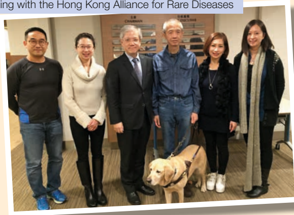
與香港罕見疾病聯盟代表首次會面 1 st Meeting with the Hong Kong Alliance for Rare Diseases