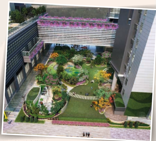
由設計師繪畫的藝術印象圖 Artistic impression prepared by designers