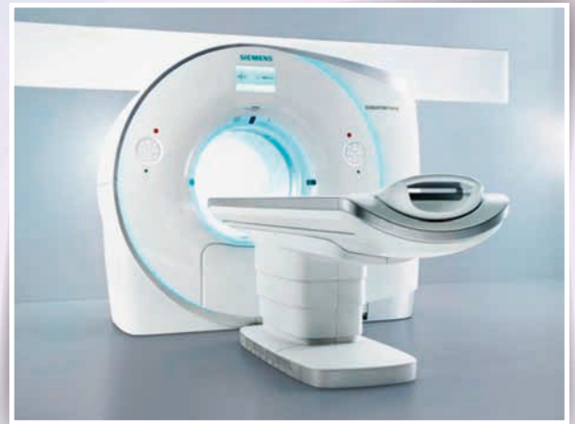
參考圖片 Reference photo