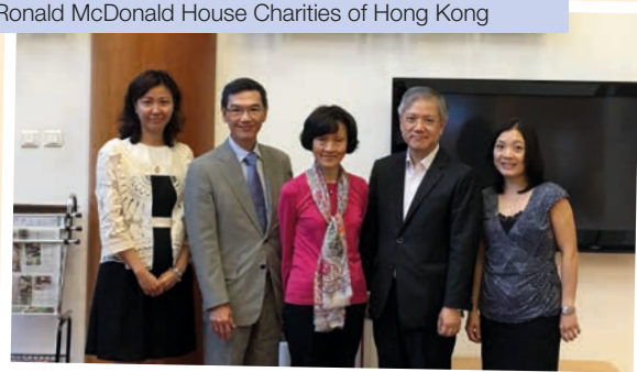
參觀香港麥當勞叔叔之家慈善基金會 Visit to Ronald McDonald House Charities of Hong Kong