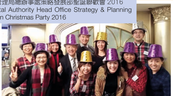
醫院管理局總辦事處策略發展部聖誕聯歡會 2016 Hospital Authority Head Office Strategy & Planning Division Christmas Party 2016